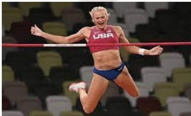
Olympic Gold Medalists Katie Moon, above, and Jenn Suhr, below are both past Winners of the Jersey Jumps Beach Vault! Jenn Set The Current Jersey Jumps Women's Record Of 15'1"!